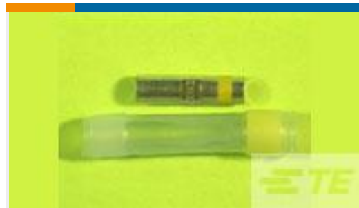
TE Part #650075N003 D-436-37CS454