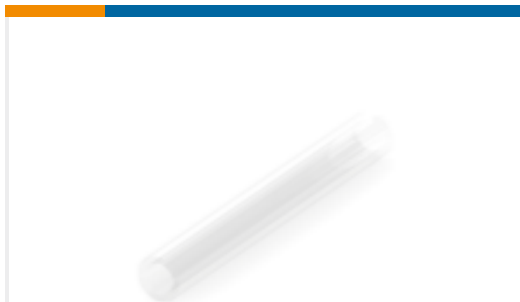
TE Part #NB15362001 CRN-3/16-X-STK