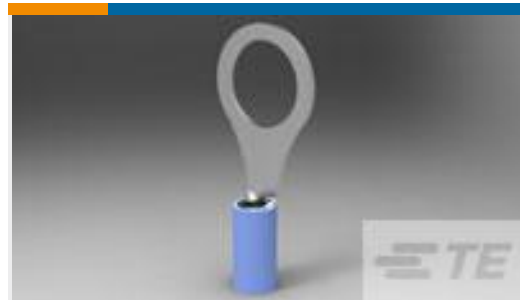
TE Part #320564 TERMINAL,PIDG R 16-14 3/8