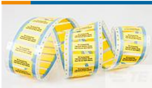
TE Part #5061850001 TMS-SCE-1/2-2.0-9