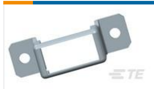
TE Part #591637-5 TJ BRKT FRAME ASSY,W/SPC MARK