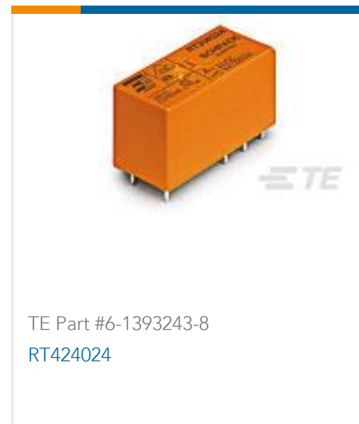
TE Part #6-1393243-8 RT424024