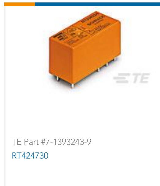
TE Part #7-1393243-9 RT424730