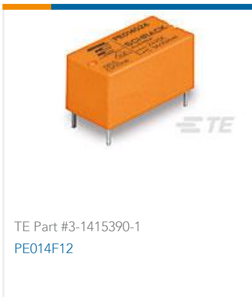
TE Part #3-1415390-1 PE014F12