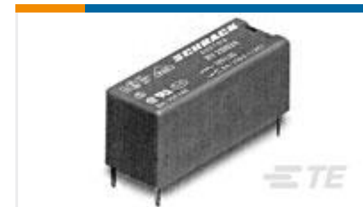
TE Part #4-1393224-6 RY211012