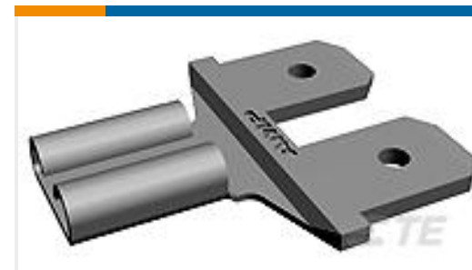
TE Part #63699-1 ADAPTER 187 FASTON TPBR