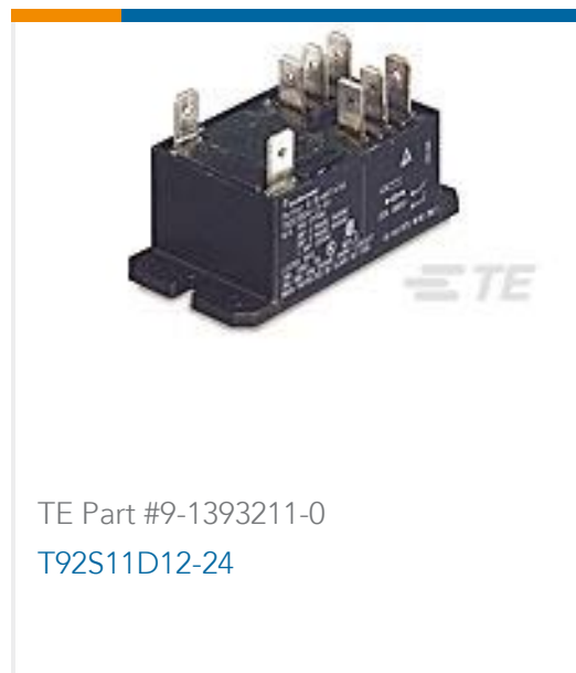
TE Part #9-1393211-0 T92S11D12-24