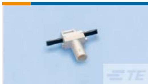
TE Part #293270-3 NECTOR S BUS BAR SEALED CONN HV-1