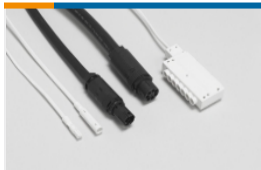
Lighting Cable Assemblies(1)