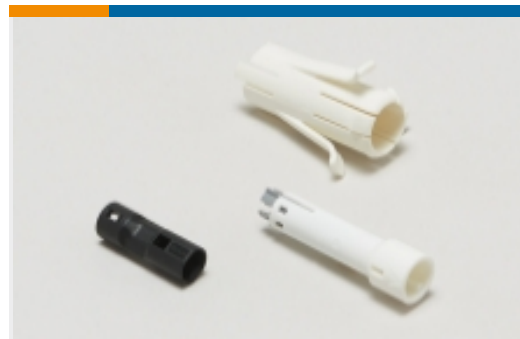
Plug & Socket Lighting Connector Accessories(57)