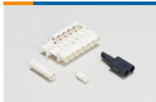
Plug & Socket Lighting Connectors(54)