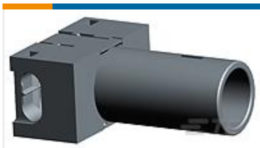
TE Part #1-2213222-1 NECTOR S BUS BAR SEALED US, THRU HV-3