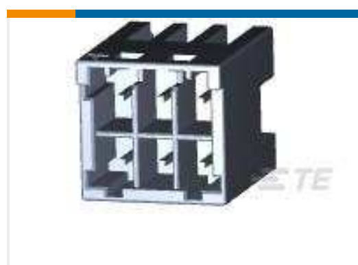
TE Part #3-1971906-3 HEADER ASSY 6POS,KEYING-C,NEW GIC3.3