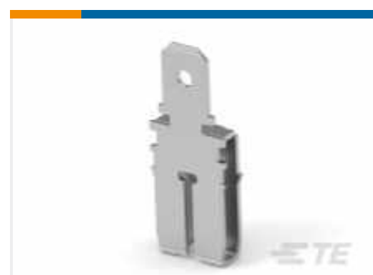
TE Part #63667-3 MAG-MATE 187 FAST TAB 020TPBR