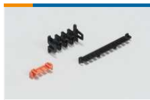
Rectangular Connector Locking(8)