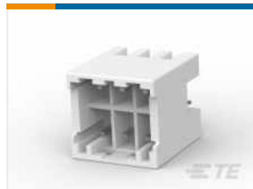
TE Part #1-1971906-5 Glow Wire GRACE INERTIA Header