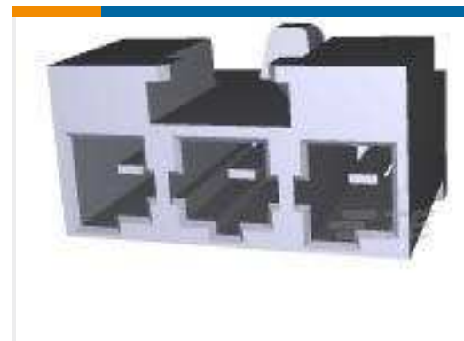
TE Part #179846-4 AMP POWER D/LOCK T/HDR ASSY 3P