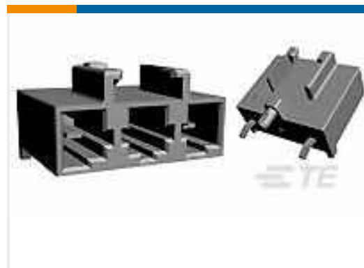
TE Part #917745-1 AMP POWER D/L TAB HDR ASY 2P V