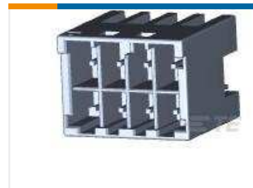
TE Part #1-1971906-4 HEADER ASSY 8POS,KEYING-A,NEW GIC3.3