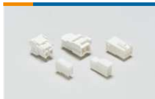
Rectangular Power Connectors(35)