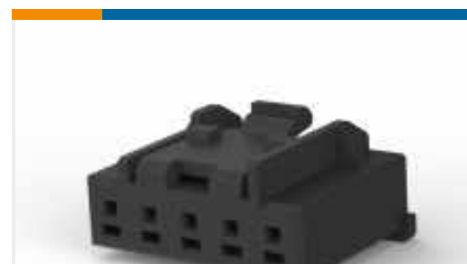
TE Part #5-1971793-5 NEW GI CONN2.5 PLUG HSG 5P BLK