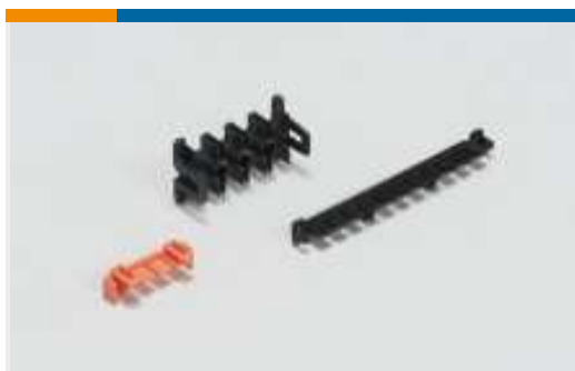
Rectangular Connector Locking(2)