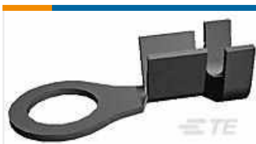
TE Part #160467-2 RT IS 1.0-2.5MM2 0.315 X .708 TPBR