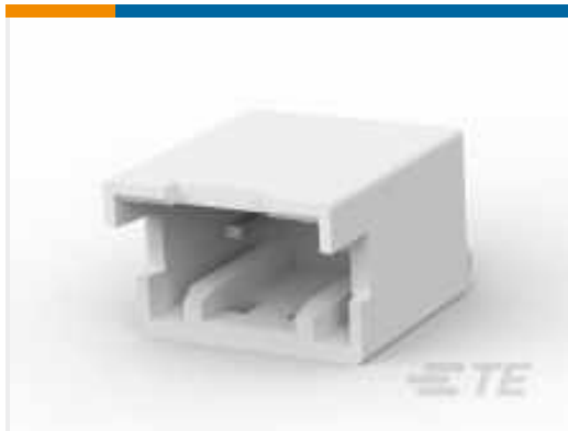
TE Part # CAT-G7534A-H342A Glow Wire Sig GRACE INERTIA Header