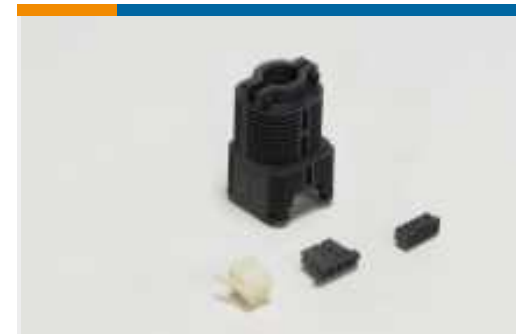
Rectangular Connector Housings(49)