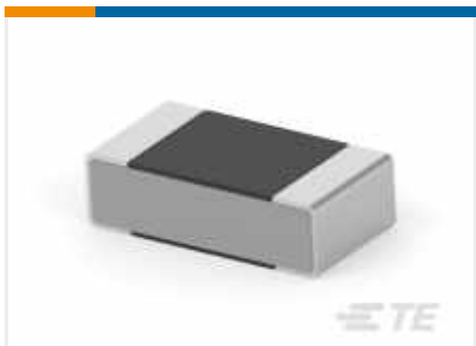
TE Part #8-1879140-4 RN 0603 137K 0.1% 10PPM 5K RL