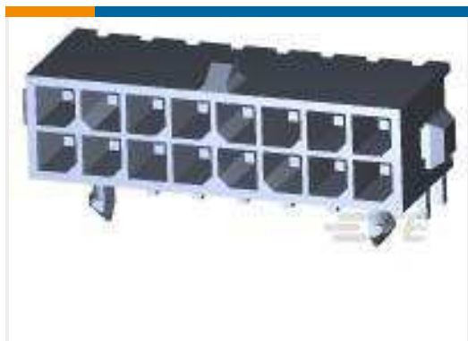
TE Part #4-794618-6 16P MICRO MNL ASSY R/A HDR LF