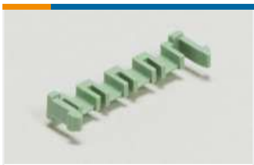
PCB Latches, Locks & Retainers(1)