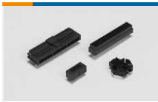
PCB Connector Shrouds(1)