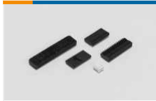
Wire-to-Board Connector Assemblies & Housings(5)