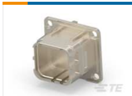
TE Part #ZPF000000000100857 Rectangular Connector Receptacles, Tool-less Assembly