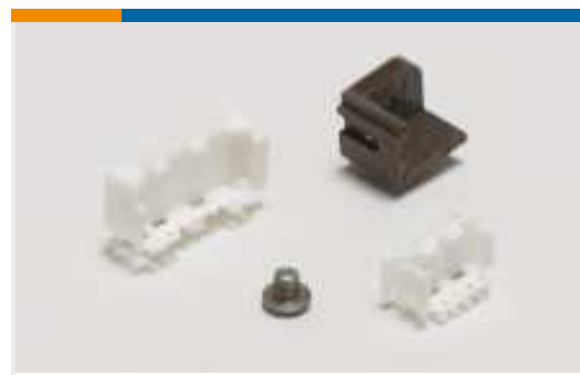
PCB Connector Mounting(1)