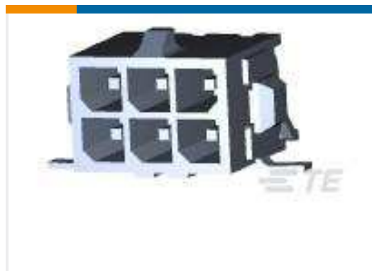
TE Part #3-794627-6 06P MICRO MNL ASSY,RA ,SMT, LF