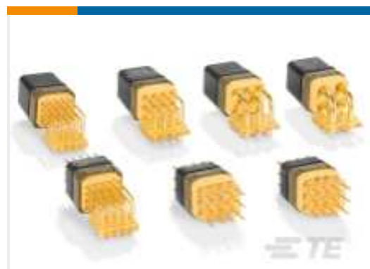
TE Part #ZPF000000000110277 732-8254-16