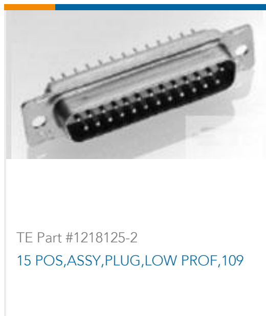
TE Part #1218125-2 15 POS,ASSY,PLUG,LOW PROF,109