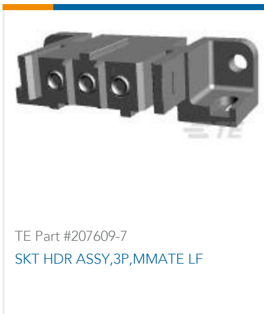
TE Part #207609-7 SKT HDR ASSY,3P,MMATE LF