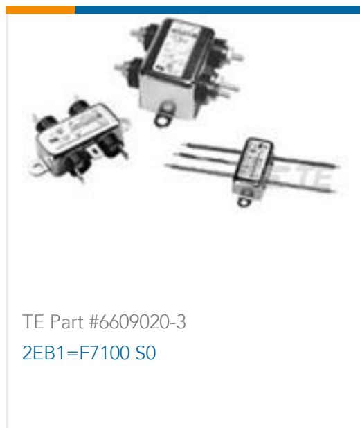
TE Part #6609020-3 2EB1=F7100 S0