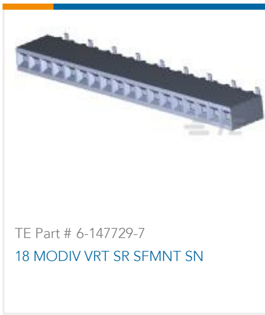
TE Part # 6-147729-7 18 MODIV VRT SR SFMNT SN