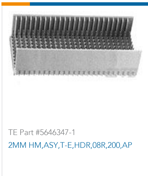
TE Part #5646347-1 2MM HM,ASY,T-E,HDR,08R,200,AP