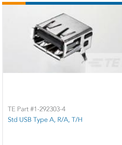
TE Part #1-292303-4 Std USB Type A, R/A, T/H