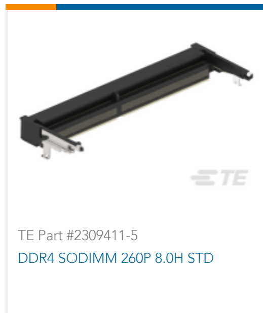
TE Part #2309411-5 DDR4 SODIMM 260P 8.0H STD