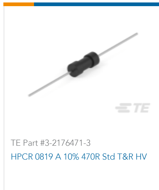
TE Part #3-2176471-3 HPCR 0819 A 10% 470R Std T&R HV