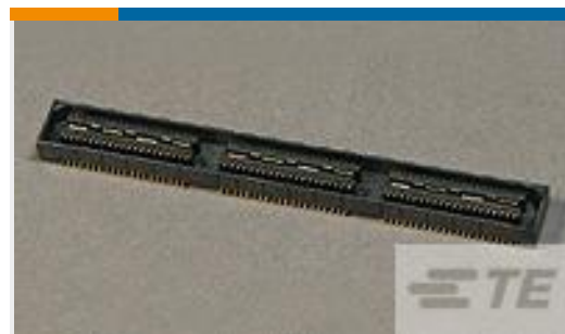
TE Part #2-1658012-3 MSB0.80RC-ASY120FL,-,10,-TY