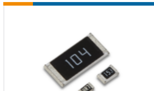
TE Part #2176347-6 CRGCQ 2010 27R 1%