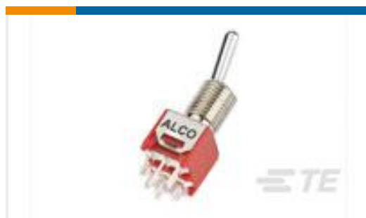
TE Part #2267077-1 TMS1T4B5M2RE