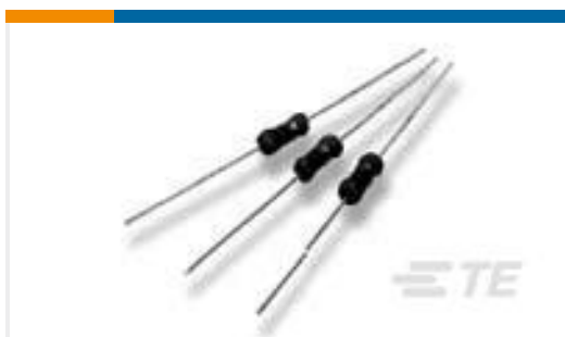
TE Part #9-1879352-1 RR02 5% 1K8 AMMO