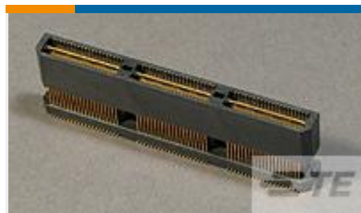
TE Part #1658017-3 MSB0.80PL19ASY120FL,-,10,-TY