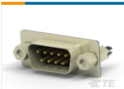
TE Part #2301826-2 AMPL PLUG HD20, VERT, 9P, B/L,4-40 S/LOC