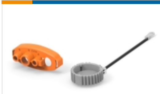
Connector Caps & Covers(40)