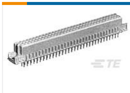
TE Part #5535032-5 ASSY,RECEPTACLE,EUROCARD,TYPE C,LEAD-FRE