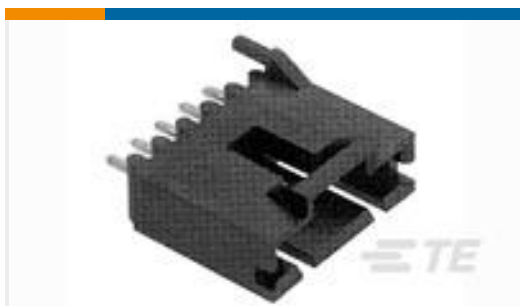
TE Part #5-104450-5 06 MTE HDR SRST LATCH W/HLDWN