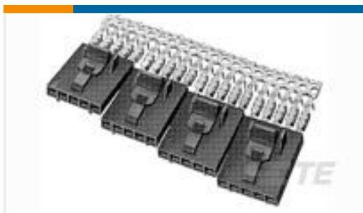
TE Part # 5-103956-9 2X10 MTE RCPT SR LATCH .100CL