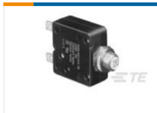
TE Part #1393249-9 W58-XB1A4A-15=W58