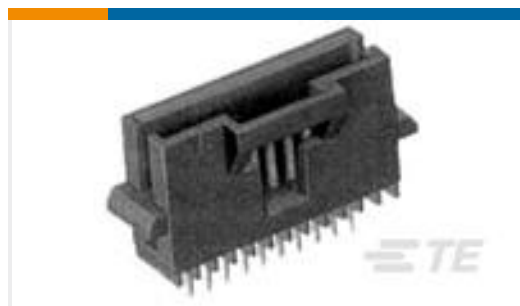
TE Part #104071-4 20 SYSTEM 50 HDR SRST SHRD