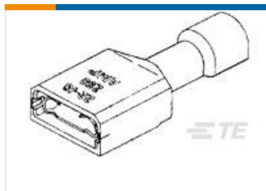
TE Part #4-520448-2 ULTRAFast 250 ASSY REC 12-10 TPBR LP