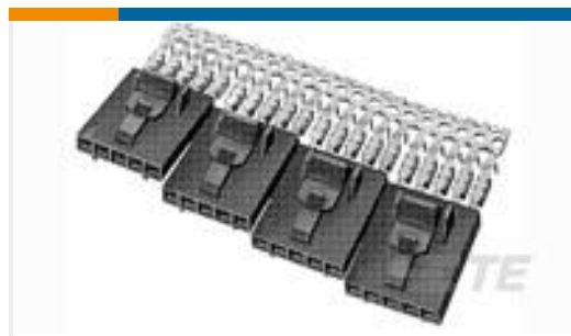
TE Part # 5-103959-9 2X10 MTE RCPT SR LATCH .100CL