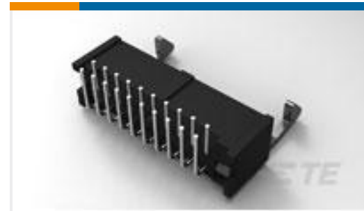
TE Part #1761607-3 IDC LOW PRO HDR 10P RA LG LAT