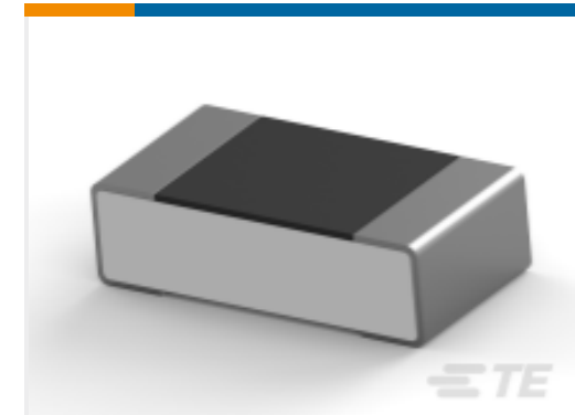
TE Part #6-2176370-4 RQ 0603 1K96 0.1% 10PPM 5K RL