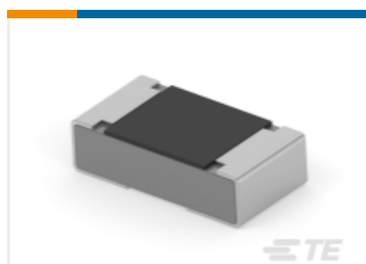
TE Part #2176481-2 RA73F 1J 6K04 0.1% 5K RL