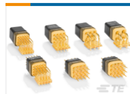
TE Part #ZPF00000000201420 732-8260-99