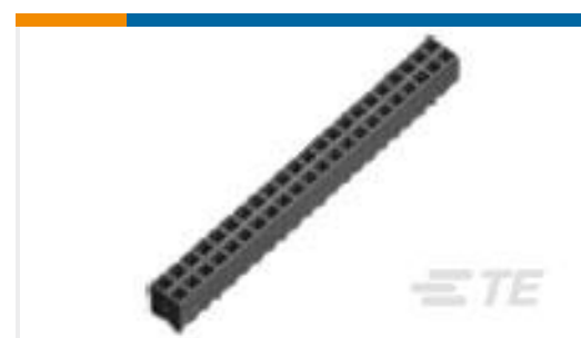
TE Part #5-1734516-8 RCPT, 2MM, 8P, VRT SMT, 30Au, W /O LOCK