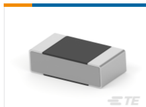
TE Part #8-1879140-8 RN 0603 150K 0.1% 10PPM 5K RL