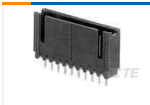
TE Part #103414-1 03 MODII HDR SRST SHRD .100CL