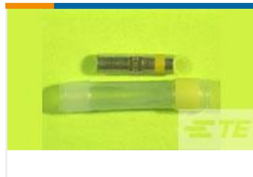
TE Part #650130-000 D-436-86