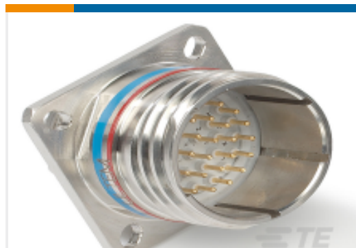
TE Part #YDTS20F13-35PNV001 RECP ASSY