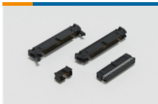
Ribbon Cable Connectors(525)