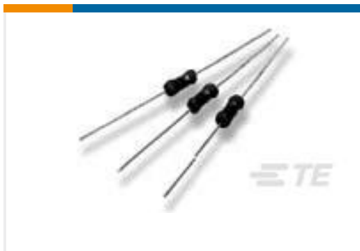
TE Part #2-1879354-1 RR03 5% 2R2 AMMO