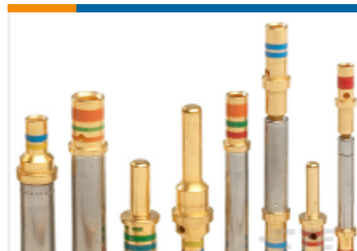
TE Part #1841-1-5620 CONT PIN