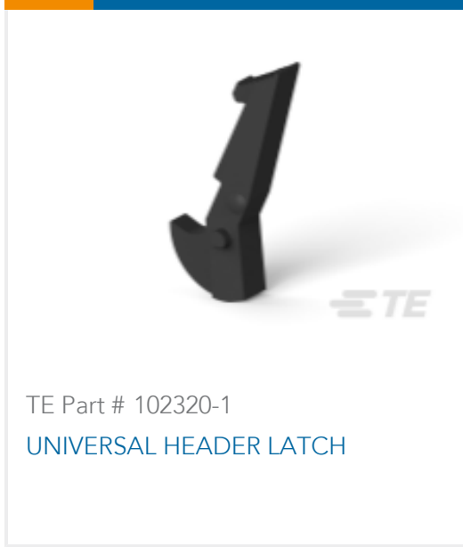
TE Part # 102320-1 UNIVERSAL HEADER LATCH