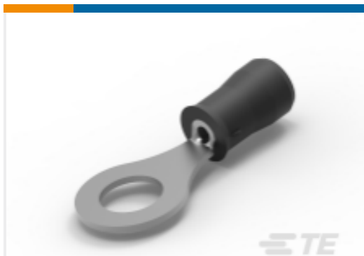
TE Part #323912 PIDG Ring Tongue Terminals