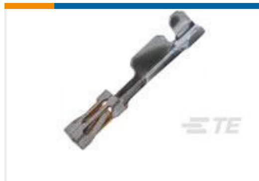
TE Part #6-87523-9 MOD IV RECP LP LF