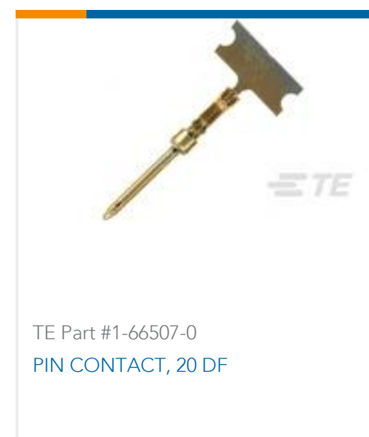
TE Part #1-66507-0 PIN CONTACT, 20 DF