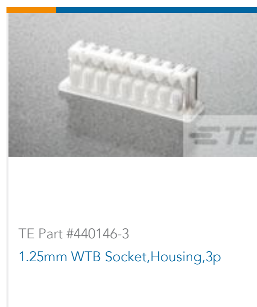
TE Part #440146-3 1.25mm WTB Socket,Housing,3p