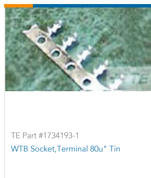
TE Part #1734193-1 WTB Socket,Terminal 80u" Tin