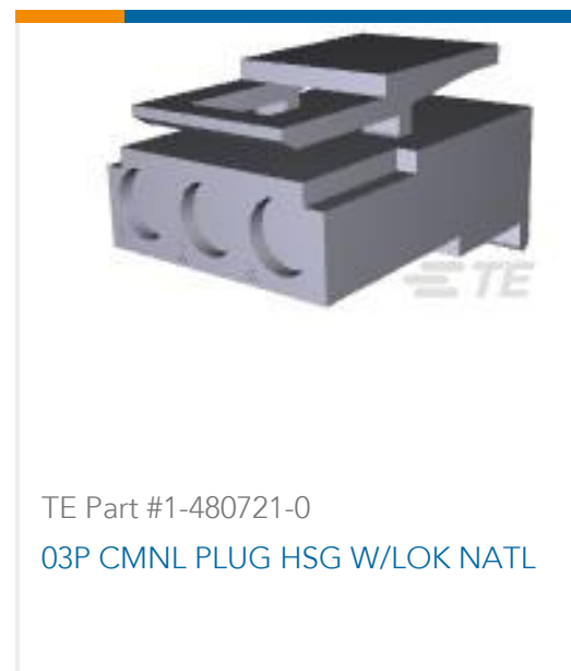
TE Part #1-480721-0 03P CMNL PLUG HSG W/LOK NATL