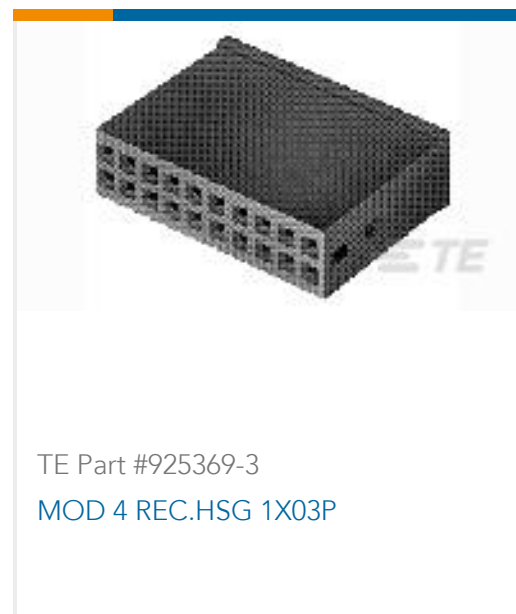
TE Part #925369-3 MOD 4 REC.HSG 1X03P