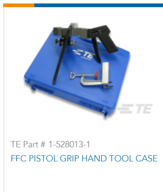
TE Part # 1-528013-1 FFC PISTOL GRIP HAND TOOL CASE