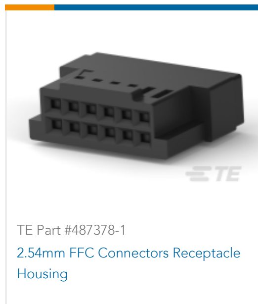
TE Part #487378-1 2.54mm FFC Connectors Receptacle Housing