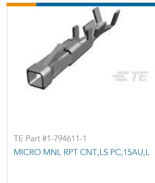
TE Part #1-794611-1 MICRO MNL RPT CNT,LS PC,15AU,L