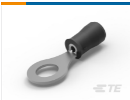
TE Part #320560 PIDG Ring Tongue Terminals