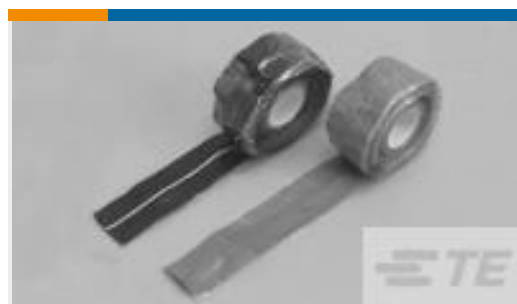
TE Part #608036-1 SILICONE FUSION TAPE,1"X36'