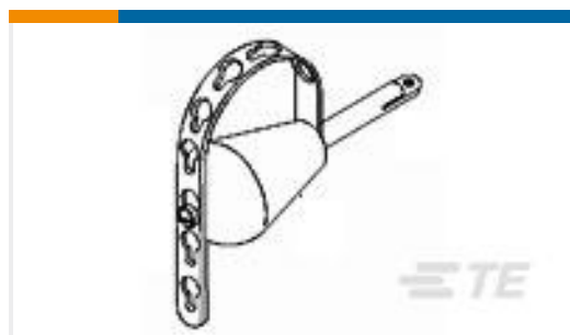
TE Part #465629-1 UNIV INSERTION TL (W/O TIPS)