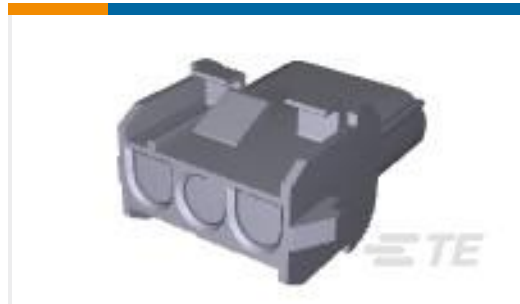
TE Part #350767-1 03P UMNL CAP HSG V0