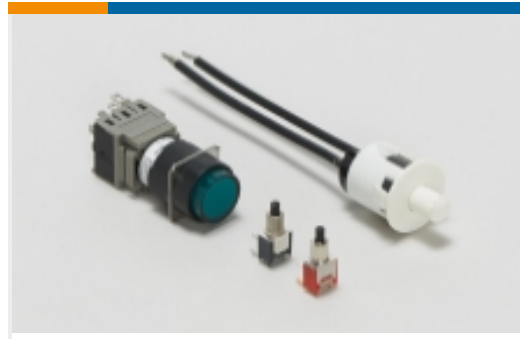
Push Button Switches(19)