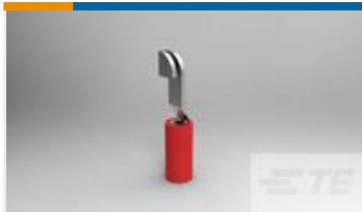
TE Part #320555 KNIFE DISCONNECT,N PIDG 22-16