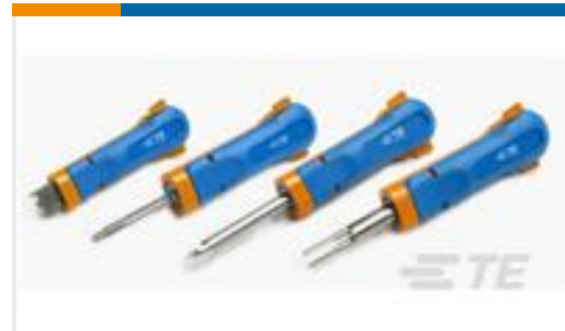
TE Part #539972-1 EXTRACTION TOOL