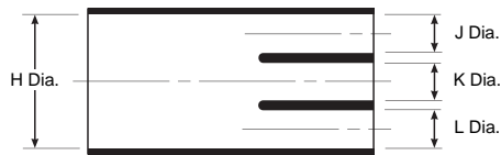
After Unrestricted Recovery (b)