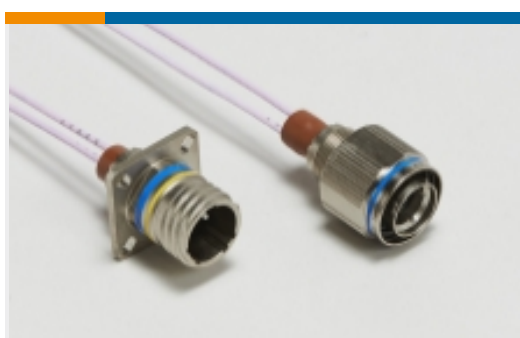
MC801 Fiber Connectors(65)