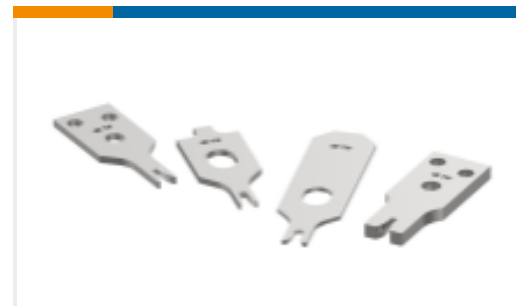
TE Part #456412-1 CRIMPER WIRE .180 F