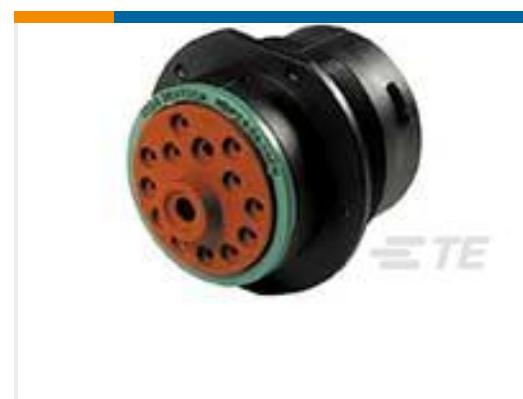
TE Part #HDP24-24-14PN REC, 14P, BLK, N, 4/12/16, P