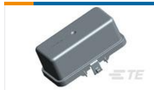
TE Part #2098164-4 Cover, 60 Pos, No Fuse Graphic or Holder