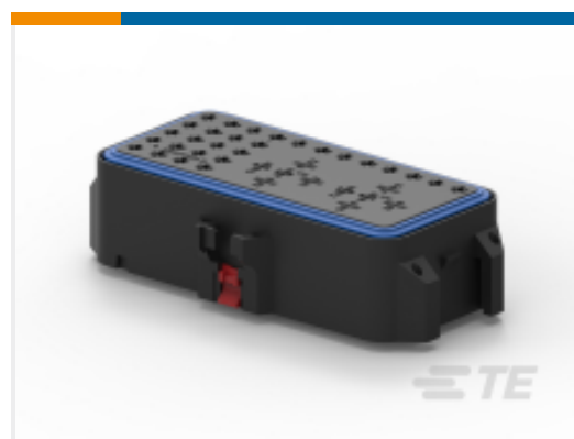
TE Part #2297813-2 BASE ASSY, 38 POSN ISO FUSE AND RELAY