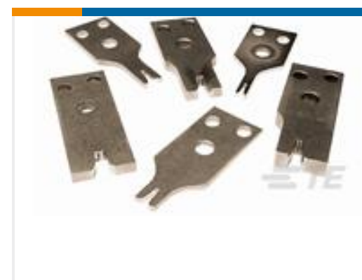
TE Part #4-456406-3 CRIMPER WIRE .090 "F"