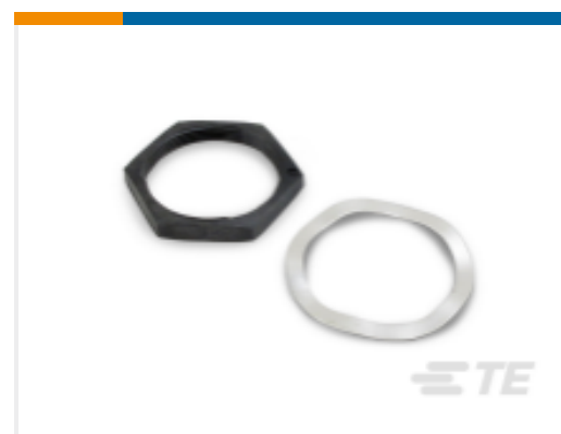
TE Part #2414-001-2486 Lockwashers and Panel Nuts for Deutsch HDP20