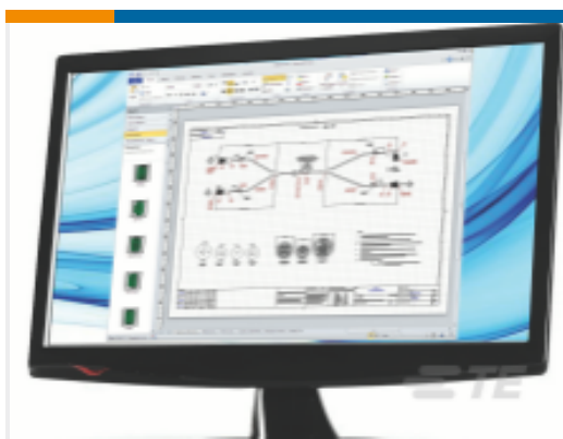
TE Part # 9-120035-5 HarnWare/HarnVis Purchase Charge