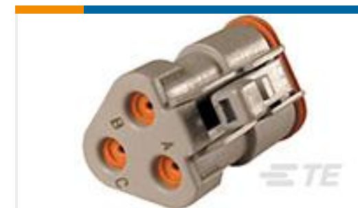
TE Part #DT06-3S-E003 PLG, 3P, GRY, N, CAP