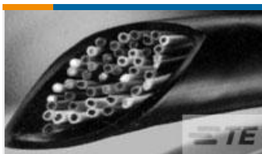
TE Part #5603764002 NTRF-1/8-0-SP