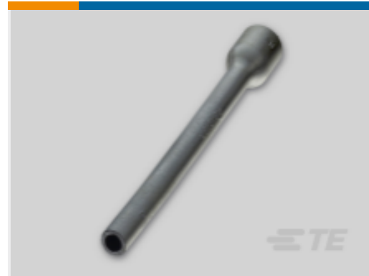
TE Part #519073N002 202D211-4-61-0-CS5077