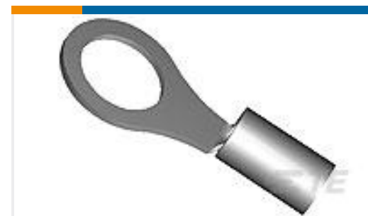
TE Part #34567 TERMINAL,SOLIS R 16-14HD 10