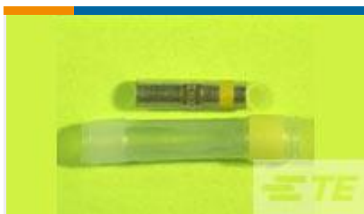
TE Part # 650075-000 D-436-37