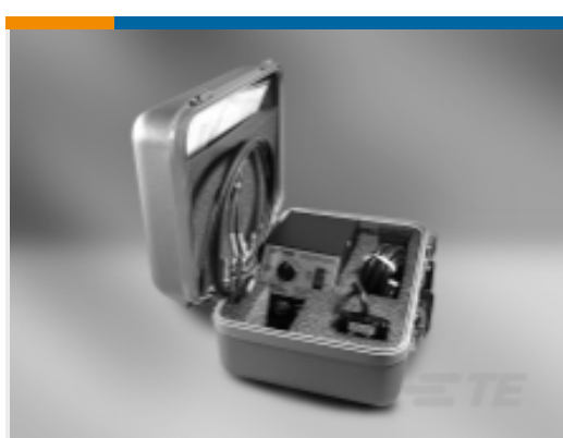
TE Part # 173643-000 RH-3960-1-TINEL-KIT-120V