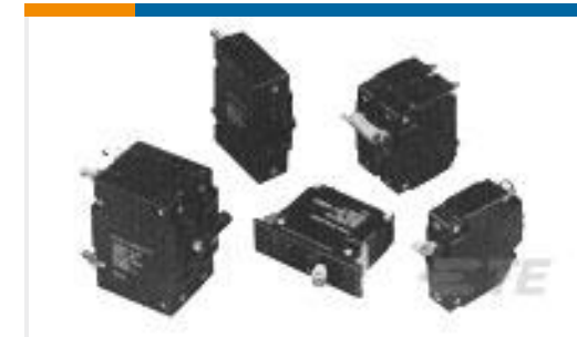
TE Part #7-1393254-2 W92-X112-20=M6/M7/M9/W6/W7