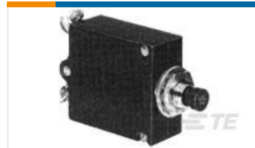
TE Part #7-1393246-4 W23-X1A1G-40=W23/W31