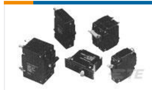
TE Part #2-1393254-3 W91-X112-15=M6/M7/M9/W6/W7