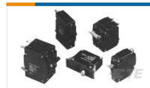
TE Part #2-1393254-5 W91-X112-20=M6/M7/M9/W6/W7