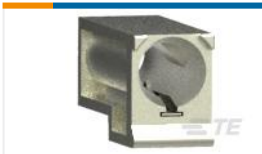
TE Part #1-1469492-8 MULTIGIG RT 9MM GUIDE/ESD 315 DEG