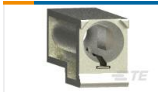
TE Part #1-1469492-7 MULTIGIG RT 9MM GUIDE/ESD 270 DEG