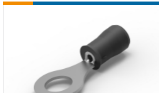
TE Part #35112 PIDG Ring Tongue Terminals