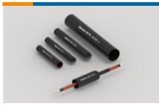
Power Cable Tubing & Accessories(8)