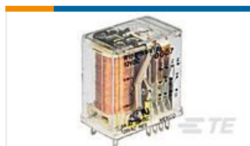
TE Part #1-1393767-5 R10-E2X2-V700=R10