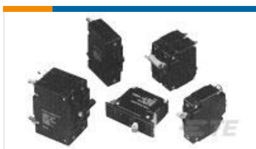
TE Part #6-1393252-1 W67-X2Q12-30=M6/M7/M9/W6/W7