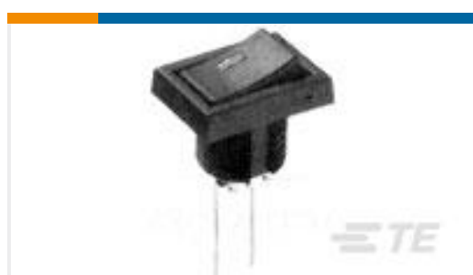
TE Part #5-1437595-2 TRD11F10WL=SUB MINI ROCKER BLA