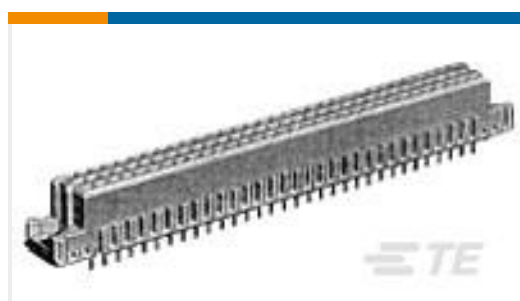
TE Part #535090-4 096 EURO TYPE C RECEPT ST ASSY