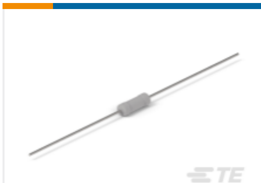
TE Part #7-1676123-7 1/2W SM M/OX 5% 1K2