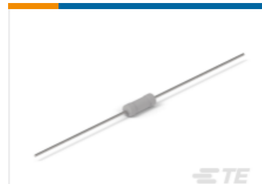
TE Part #6-1676123-0 1/2W SM M/OX 5% 240R