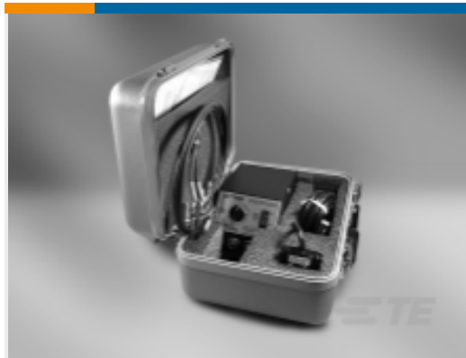
TE Part # 173643-000 RH-3960-1-TINEL-KIT-120V