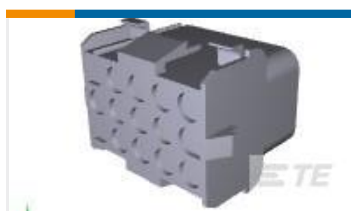
TE Part #926647-2 15P UN-MNL AUFN-GEH