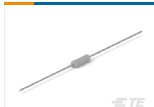
TE Part #7-1676123-9 1/2W SM M/OX 5% 1K5