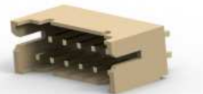
TE Part #5-1977909-2 12P,2.0MM HDR. PIN 12 OMITTED, 2.1 LEADS