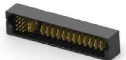
TE Part #6450821-6 MBXL VERT HDR 12S+2HDP+12LP