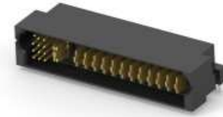
TE Part #5-6450831-9 MBXL R/A HDR12S+2P+12LP