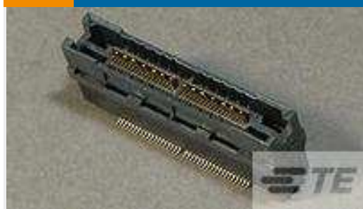
TE Part #5767178-2 MICTOR .355 RECEPTACLE, 76 POS T&R PACKA