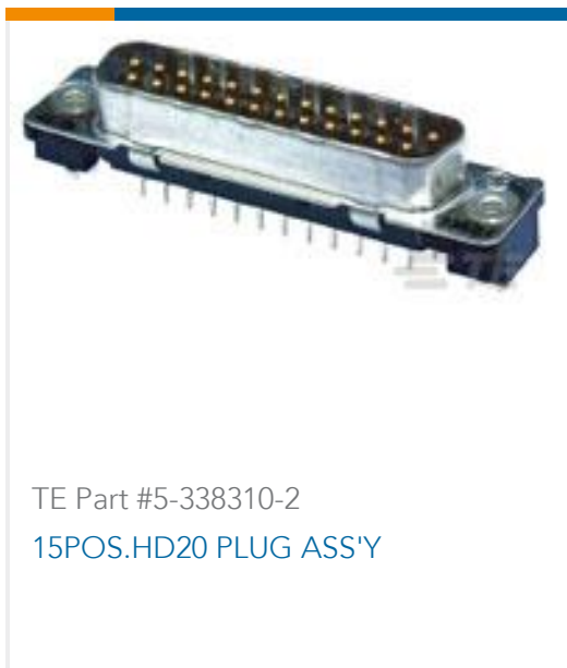
TE Part #5-338310-2 15POS.HD20 PLUG ASS'Y