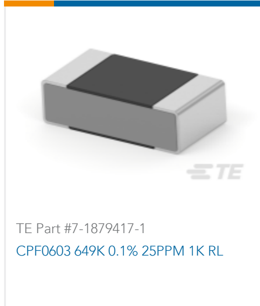
TE Part #7-1879417-1 CPF0603 649K 0.1% 25PPM 1K RL