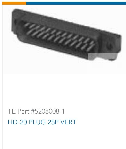
TE Part #5208008-1 HD-20 PLUG 25P VERT