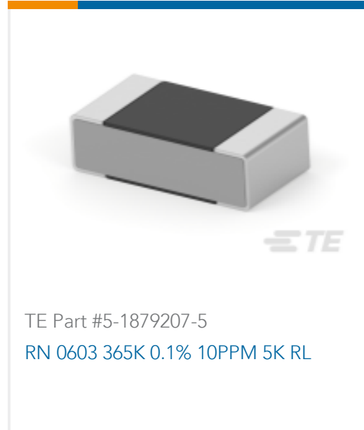
TE Part #5-1879207-5 RN 0603 365K 0.1% 10PPM 5K RL