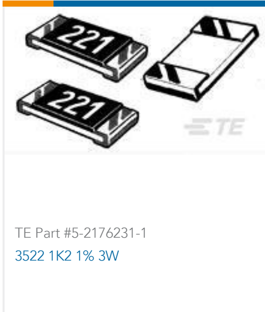
TE Part #5-2176231-1 3522 1K2 1% 3W