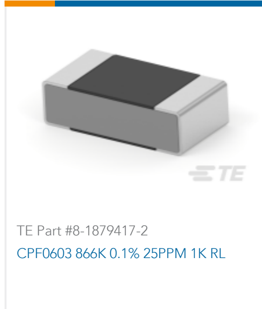
TE Part #8-1879417-2 CPF0603 866K 0.1% 25PPM 1K RL