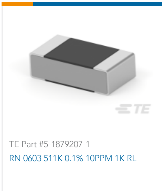
TE Part #5-1879207-1 RN 0603 511K 0.1% 10PPM 1K RL