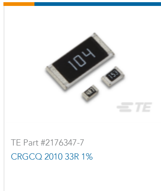
TE Part #2176347-7 CRGCO 2010 33R 1%