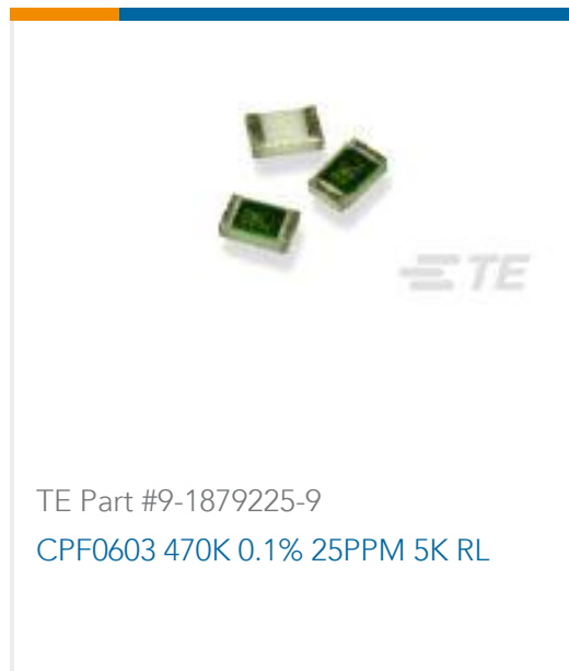
TE Part #9-1879225-9 CPF0603 470K 0.1% 25PPM 5K RL