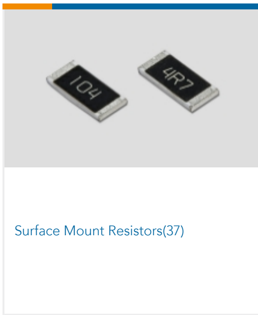
Surface Mount Resistors(37)