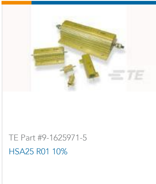
TE Part #9-1625971-5 HSA25 R01 10%