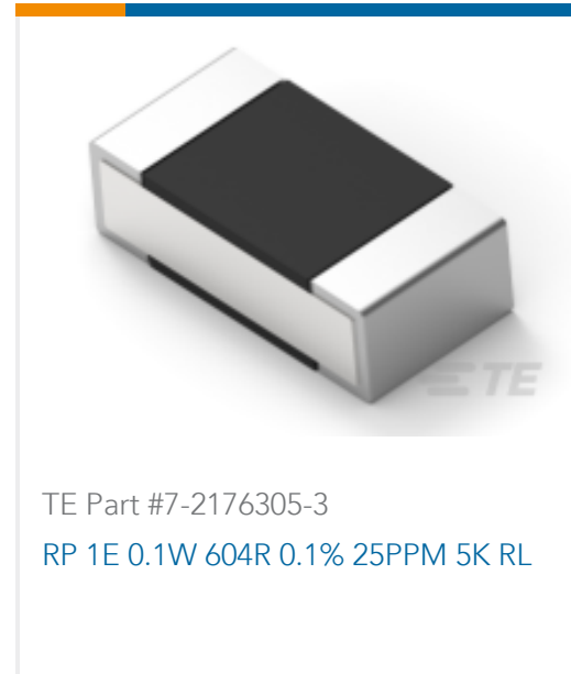
TE Part #7-2176305-3 RP 1E 0.1W 604R 0.1% 25PPM 5K RL