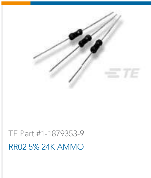
TE Part #1-1879353-9 RR02 5% 24K AMMO