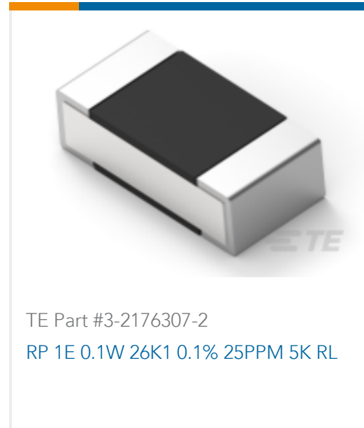
TE Part #3-2176307-2 RP 1E 0.1W 26K1 0.1% 25PPM 5K RL