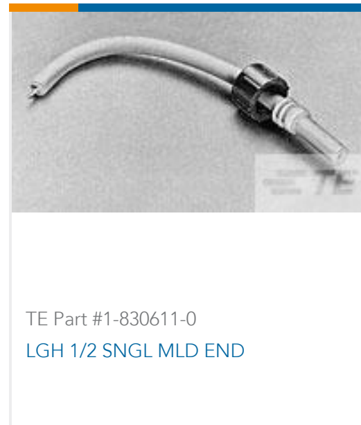
TE Part #1-830611-0 LGH 1/2 SNGL MLD END