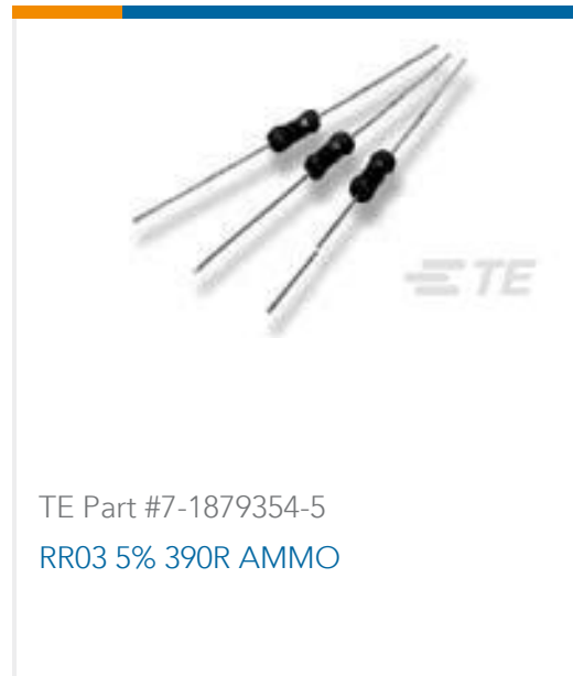
TE Part #7-1879354-5 RR03 5% 390R AMMO