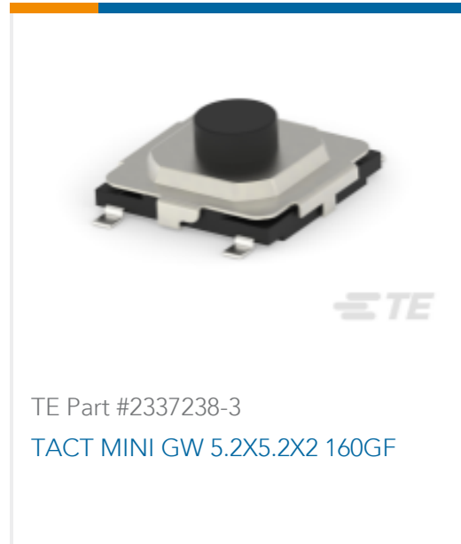
TE Part #2337238-3 TACT MINI GW 5.2X5.2X2 160GF