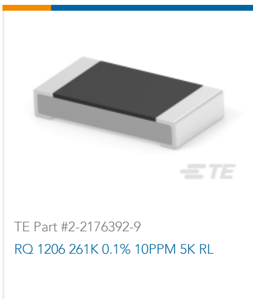
TE Part #2-2176392-9 RQ 1206 261K 0.1% 10PPM 5K RL