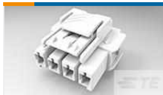
TE Part #1-1971773-4 PTL 1X4 PLUG HSG STD TEMP KEY A NAT