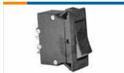
TE Part #2-1423673-3 W51-A161A1-15=CKTBKR,THERM, ROC-