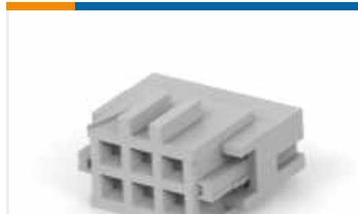
TE Part #215882-6 AMP-LATCH MIL TYPE RCPT CONNECTOR