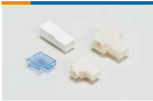
Crimp Terminal Housings(13)