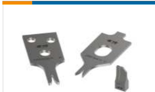
TE Part #7-2266813-7 OCEAN_2.0_SPARE_PART_KIT-055F062F