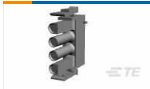
TE Part #926298-5 UN-MNL STECK-GEH 4P