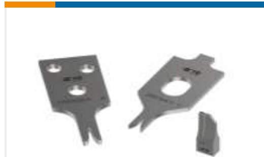
TE Part #7-2837932-7 OCEAN_2.0_SPARE_PART_KIT-062F0910