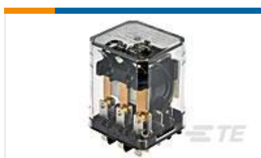
TE Part # 4-1393117-3 KUP-11D15-110=KU