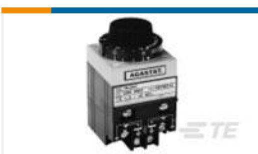
TE Part # 2-1423159-3 7012PC=RLY,STD,ON,2P,125VDC,15