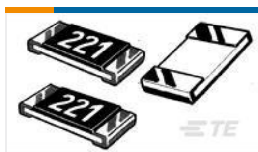
TE Part # 8-2176070-5 3521 33K 1% 2W