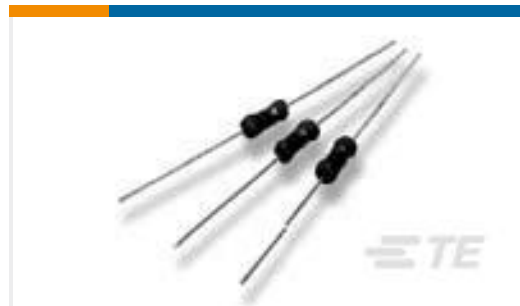
TE Part #1-1879355-3 RR03 5% 13K AMMO