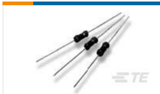
TE Part #1879353-4 RR02 5% 5K6 AMMO