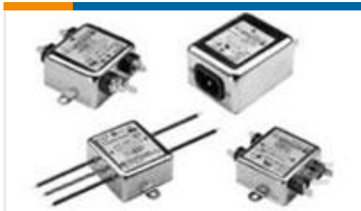
TE Part #6609028-6 3VK3=F7136 S0