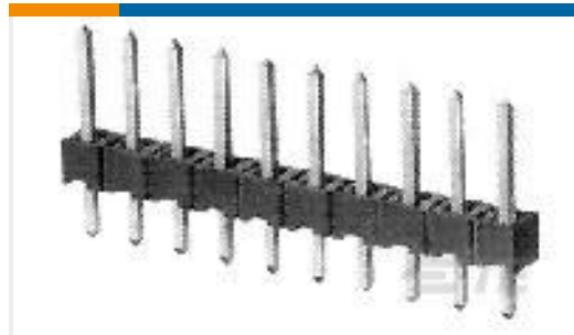
TE Part #826646-2 AMPMODU II R/A HEADER