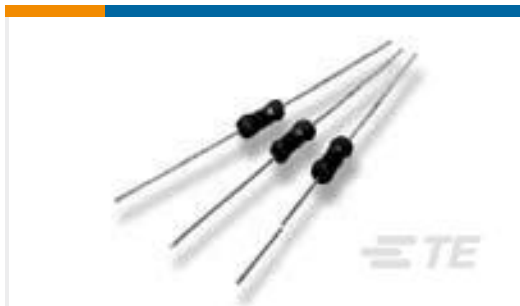
TE Part #1-1879353-3 RR02 5% 13K AMMO