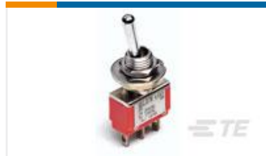
TE Part #1-1825139-6 A205SYCB04