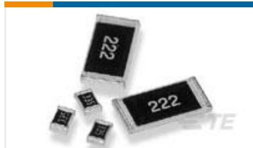
TE Part #1623156-1 CRG0805 1% 220R