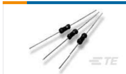
TE Part #2-1879355-3 RR03 5% 36K AMMO