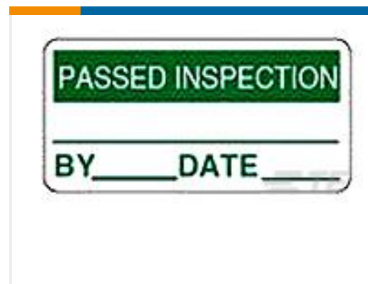
TE Part #1878644-5 MAM115