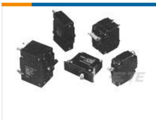
TE Part #2-1393253-1 W68-X2Q110-20=M6/M7/M9/W6/W7