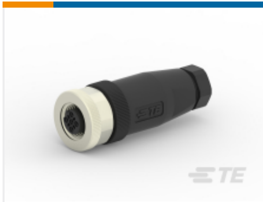
TE Part #T4110401051-000 M12,FEMALE,STRAIGHT,B CODE,5P, PG7,GOLD