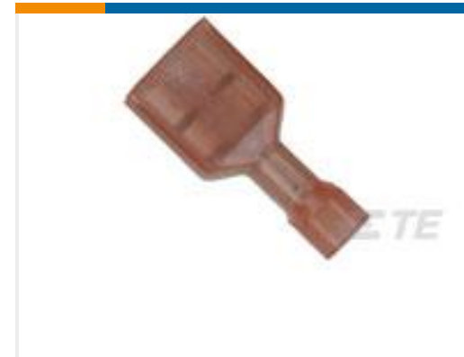
TE Part #2-520183-2 ULTRA-FAST 250 ASY REC 22-18 TPBR