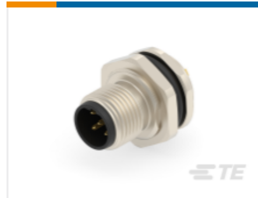
TE Part #T4130412051-000 M12,REAR MOUNT,MALE,B,5P, SOLDER WIRE