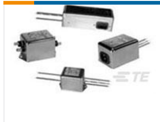
TE Part #6609048-3 3EQ8=F7260 S0