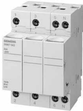
SENTRON, cylindrical fuse holder, 10x38 mm, 3-pole, In: 32 A, Un AC: 690 V