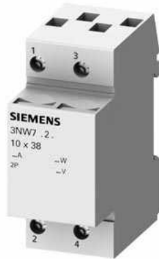
SENTRON, cylindrical fuse holder, 10x38 mm, 2-pole, In: 32 A, Un AC: 690 V