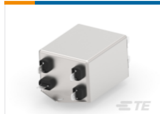
TE Part #1-1609965-2 KEB 6A 1S SPADE DELTA 440VAC