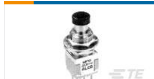
TE Part #5-1437567-3 MPG206R=(MSPG) SW PUSHBUTTON