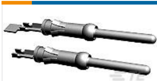
TE Part #1-66400-0 III+ PIN,24-20,TIN,LP