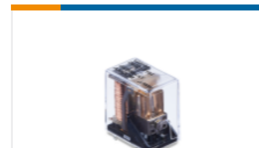
TE Part #2-1393810-7 Signal Relays: 5 Amp, Monostable DC