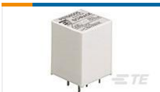
TE Part #8-1415029-1 PB114012