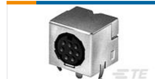
TE Part #1658998-1 Mini DIN, 8 pos, R/A, Shield