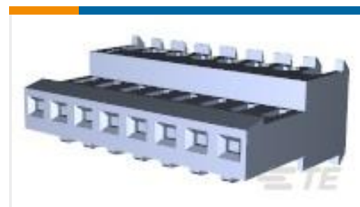
TE Part #3-640620-8 08P MTA100 CONN ASSY F/T RED