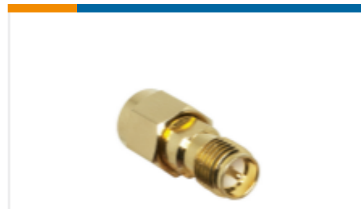
TE Part #ADP-SMAM-RPSF-G SMA Plug to RP-SMA Jack