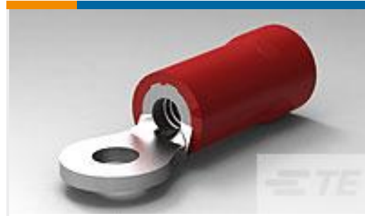
TE Part #34140 PG R 22-16 COMM 22-18 MIL 2