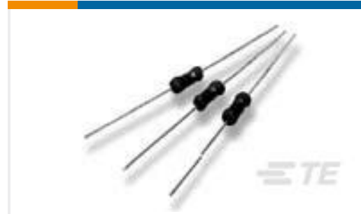
TE Part #1625892-9 3W SM M/OX 5% 100R