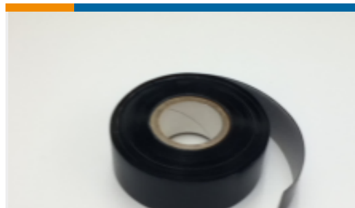
TE Part #890901-006 S1030