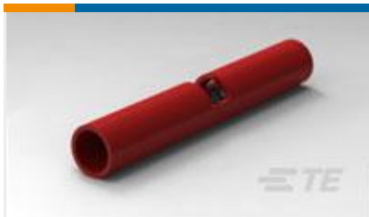
TE Part #320559 PIDG SPLICE 22-16COMM 22-18MIL