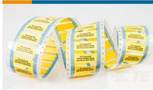
TE Part #4575670001 TMS-SCE-1K-3/4-2.0-9