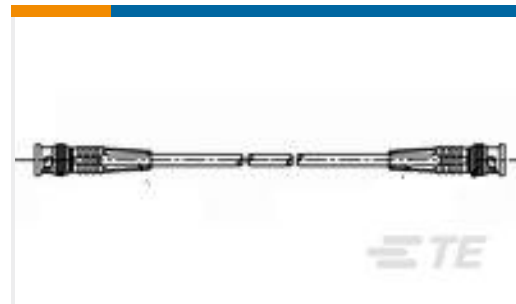
TE Part #1337775-3 75 OHM COAX BNC STR PLUG-P99-E