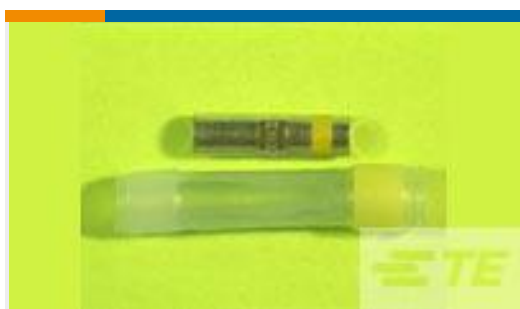
TE Part #650129-000 D-436-85