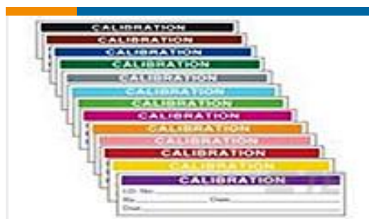
TE Part #1878646-5 MQC205RD