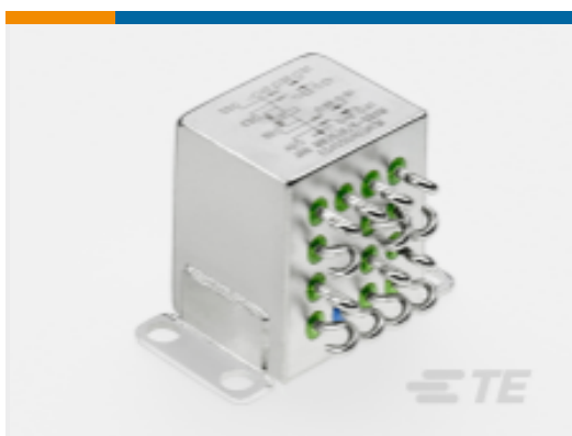
TE Part #ES4050404BGM ES4050404BGM=RELAY