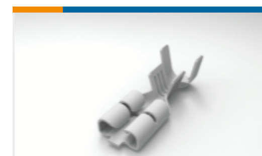
TE Part # 2293255-1 FASTON 187 REC 0.5-1.5MM2 TPBR