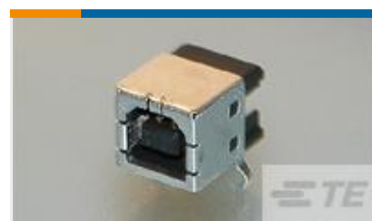
TE Part # 292304-2 STD USB TYPE B, R/A, T/H