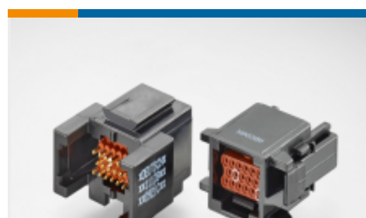
TE Part #ABC03N-20P IN-LINE RECP