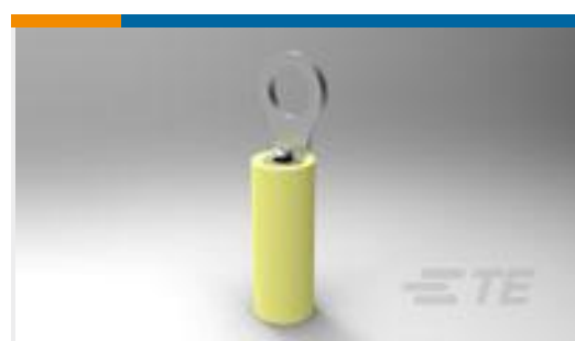
TE Part #323912 TERMINAL,PIDG R 26-22 2