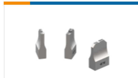
ANVIL REPRESENTATION ONLY