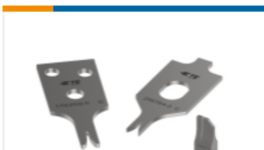
KIT REPRESENTATION ONLY