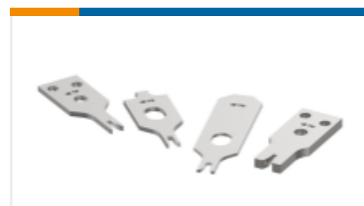
CRIMPER REPRESENTATION ONLY