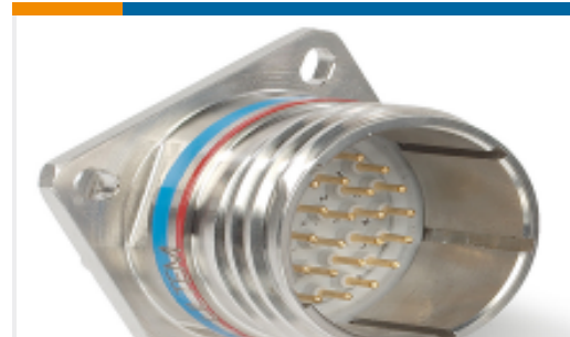
TE Part #YDTS20F25-61SNV001 RECP ASSY