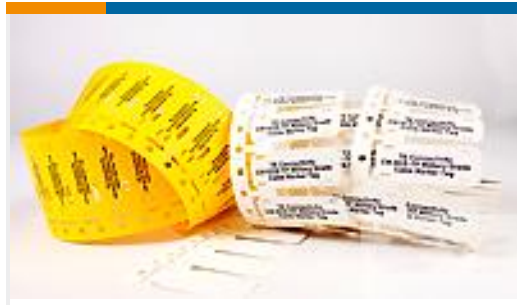
TE Part #E99238-000 HTCM-SCE-TP-1/2-4H-9