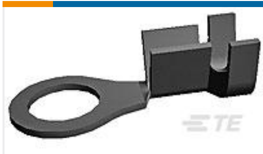
TE Part #140546 RING TONGUE 18-14 .236X.390 ELCTRO TPBR