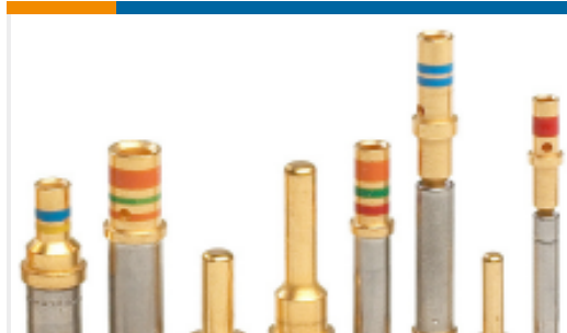
TE Part #ZPF000000000000345 006-0912-20 A