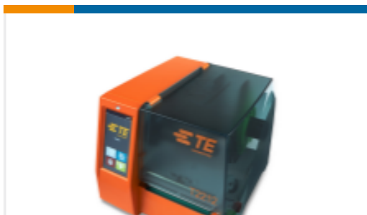
TE Part #1-2186527-1 T2212-PRINTER