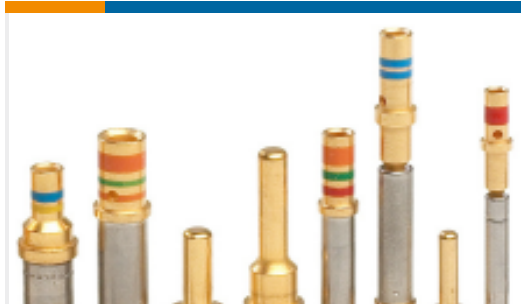
TE Part #ZPF000000000000363 006-0937-20