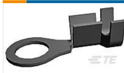
TE Part #140523 RT .171 DIA TERMINAL 20-16 AWG BR