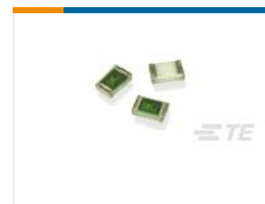
TE Part #2-1879129-5 RN 0402 1K47 0.1% 10PPM CUT LENGTH