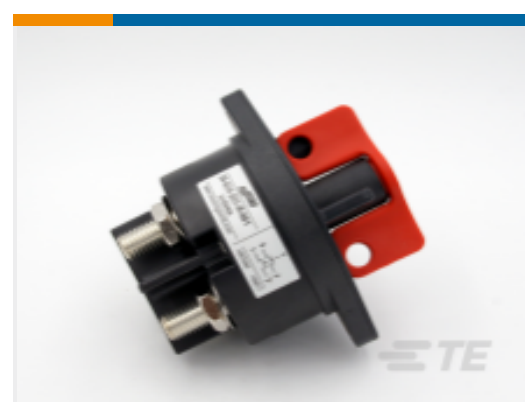
TE Part #K1137217 Battery Disconnecter 35-524-231-R-900