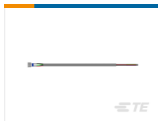
TE Part #2317659-9 AV25 DPM 3A MOVING RING POWER R&G 12V FL