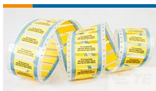
TE Part #0567590001 TMS-SCE-3/4-2.0-9