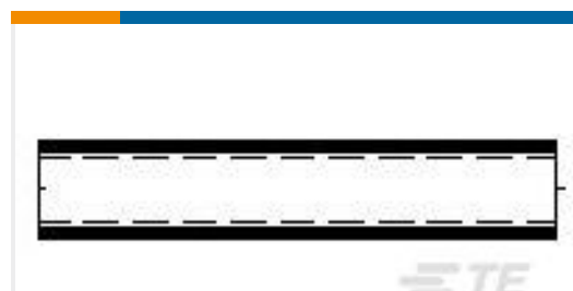
TE Part #751921-000 AT099-26