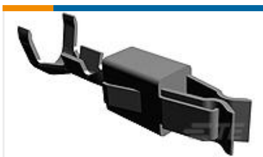
TE Part #964285-2 JPT A REC 2.8 Contact SRC Sn (LP)