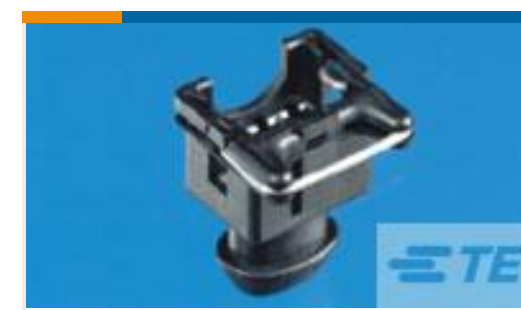
TE Part #282189-4 SPLASH PROOF CONN. W.S.L.