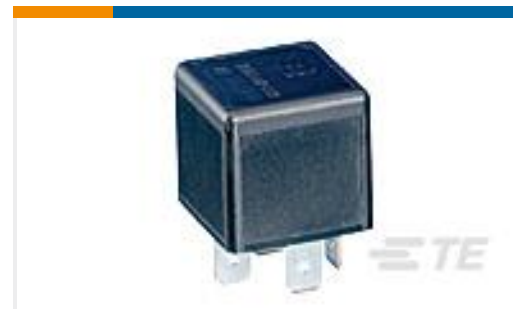
TE Part #1-1414167-0 V23134A0056X432-EV-CBOX