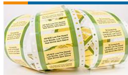
TE Part #E46987-000 HX-SCE-1K-2.4-50-S1-4