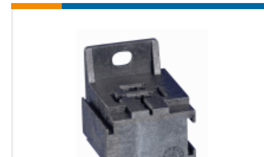
TE Part #1-1904045-2 V23333Z1001A008-EV-100