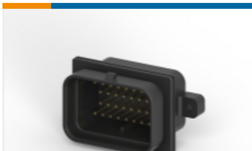
TE Part #2-6447232-3 SUPER SEAL 34POS CAP ASSY V AU