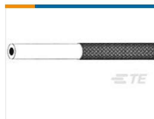
TE Part # A165103001 RAY-101-7.5(100)