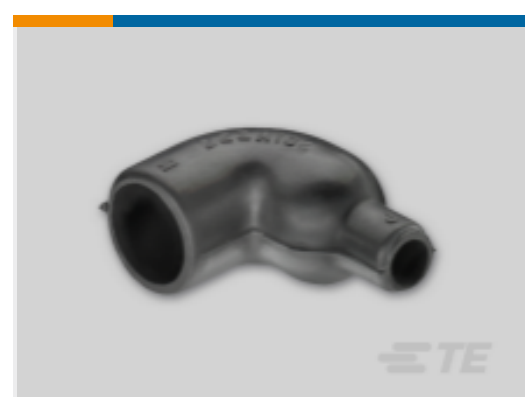
TE Part # 723486-000 Bulbous Heat Shrink Boots: Lipped, Right Angle