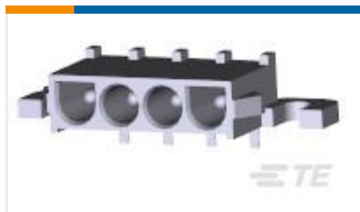
TE Part #1-350944-0 04P UMNL HDR ASSY R/A 94VO