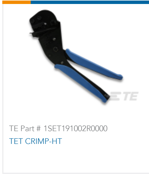
TE Part # 1SET191002R0000 TET CRIMP-HT