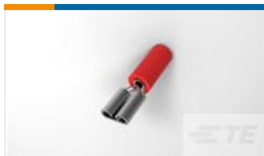
TE Part #640909-1 RECEPT,PIDG FASTON 22-18 205