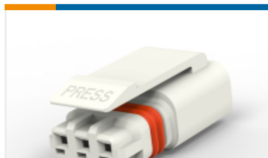
TE Part #1-2834074-3 3P PLUG, MINIATURE WATERPROOF CONN,WHITE