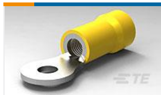
TE Part #34853 TERMINAL,PG R 12-10 8