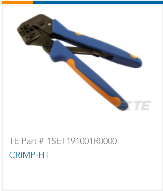
TE Part # 1SET191001R0000 CRIMP-HT