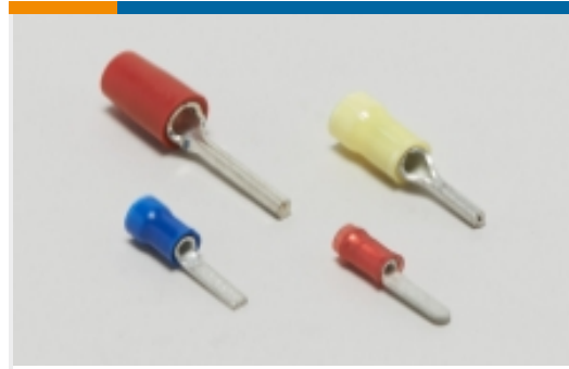
Crimp Wire Pins, Tabs & Ferrules(19)