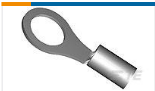
TE Part #31518 TERMINAL,DG R 26-22 2