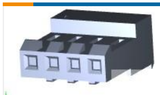
TE Part #3-640428-4 04P MTA156 CONN ASSY 22AWG RED